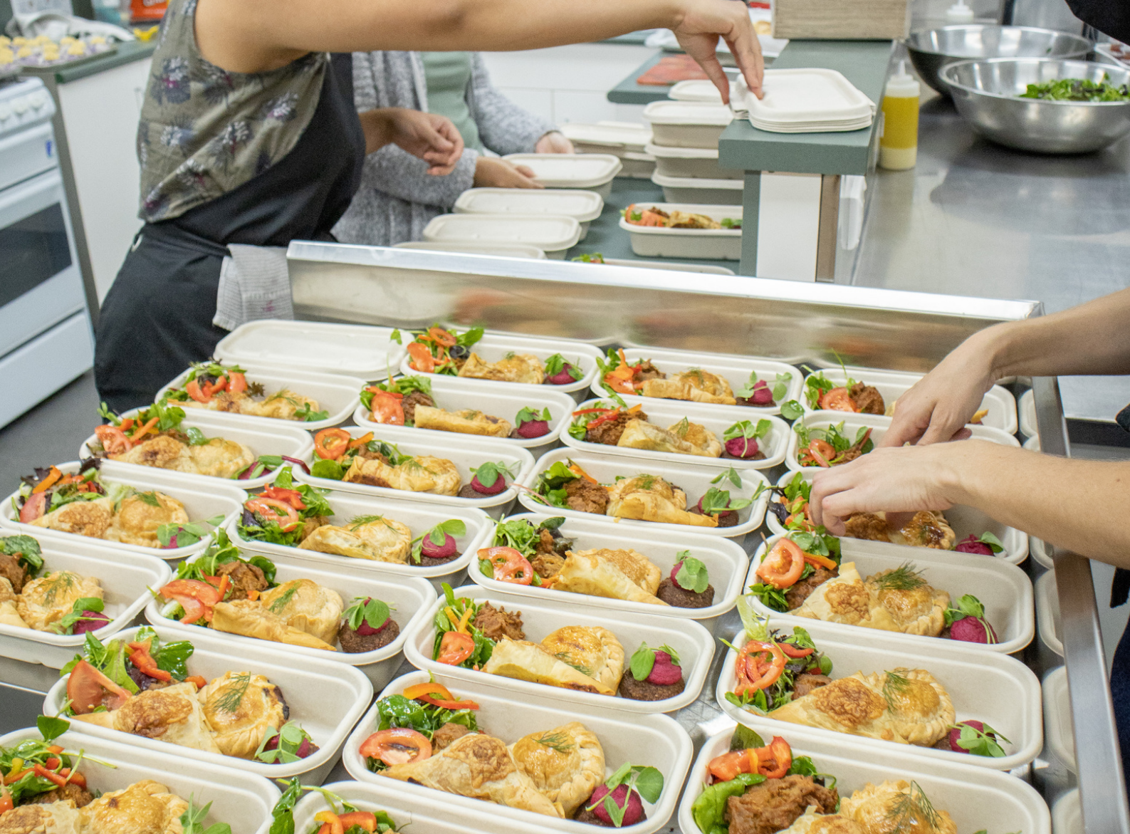
Commercial and Community Kitchen Preparing Food for an Event