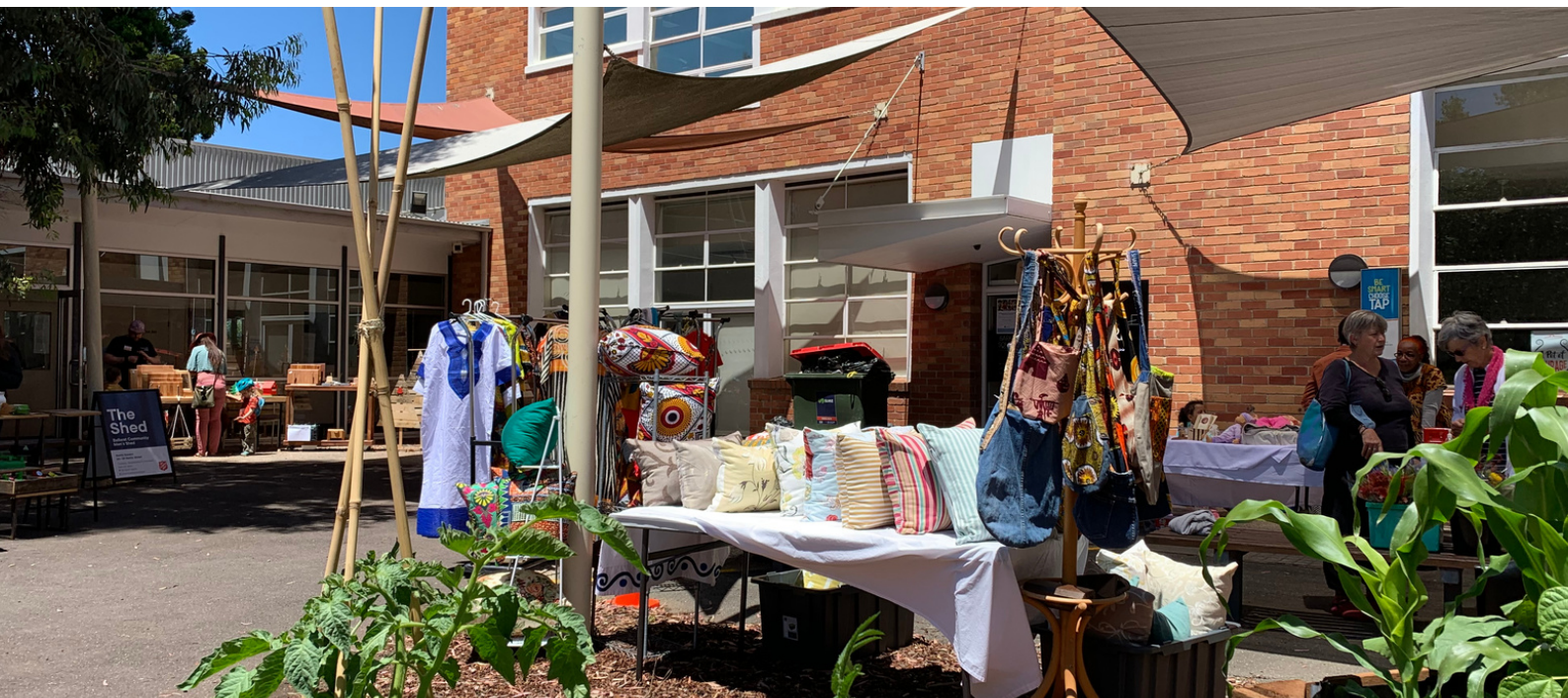
Market Stalls and Shoppers