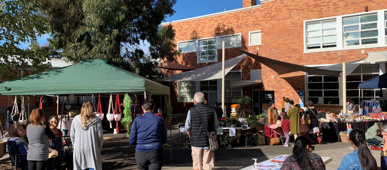
Market Set Up in outer courtyard