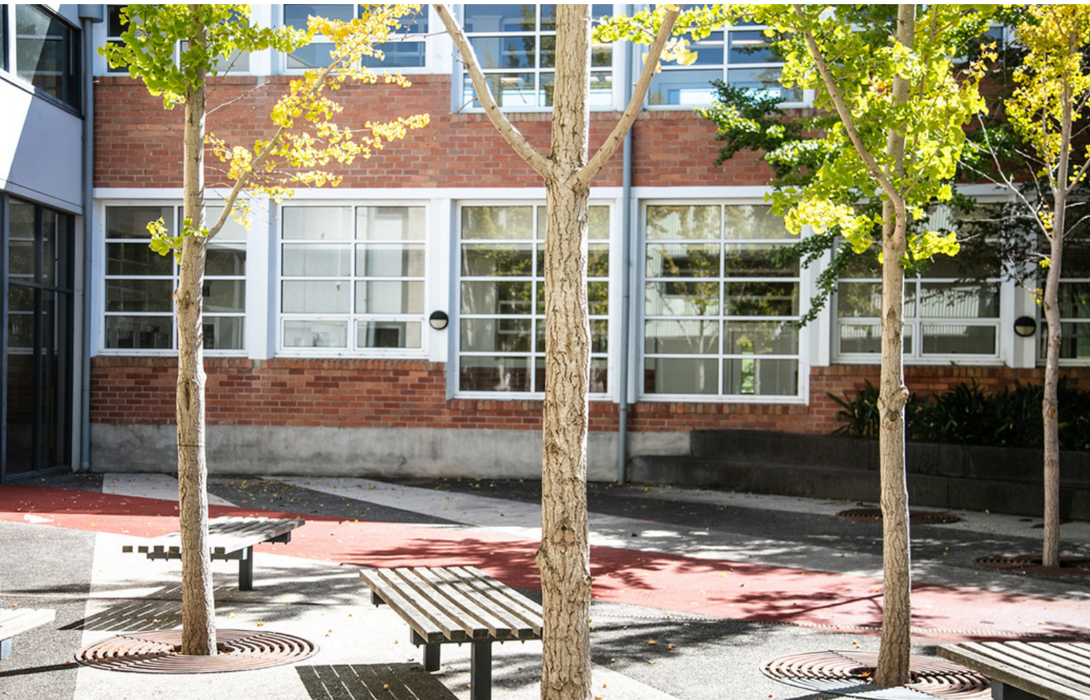
Barkly Square Courtyard