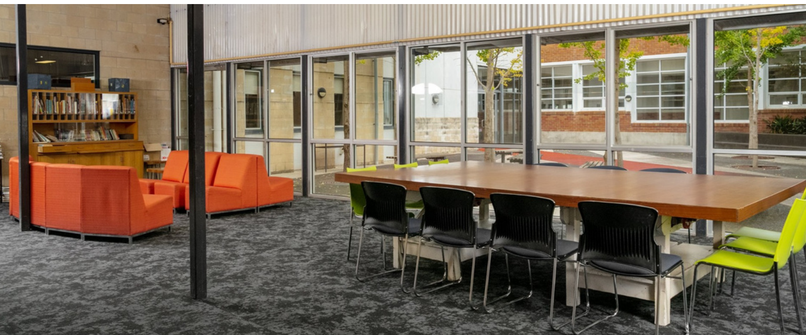
Atrium Community Space