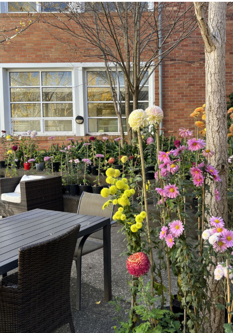
Floral Display for Oasis in the Desert