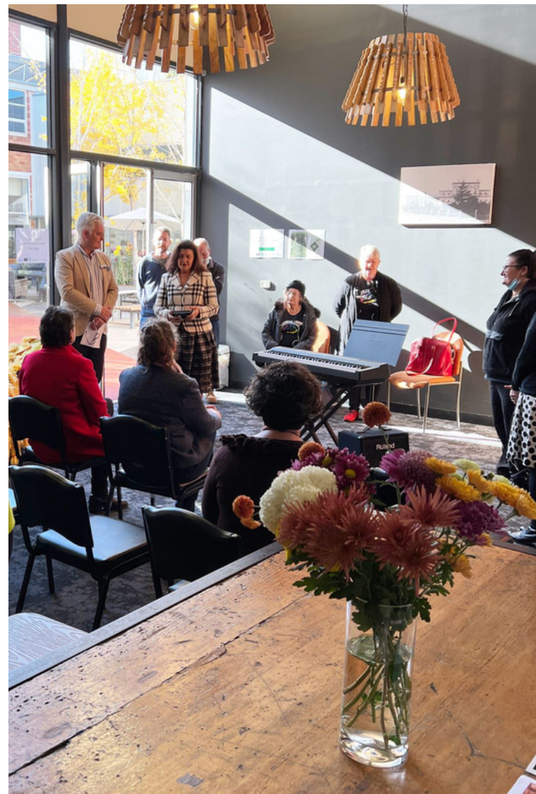
Welcome Event for Oasis in the Desert