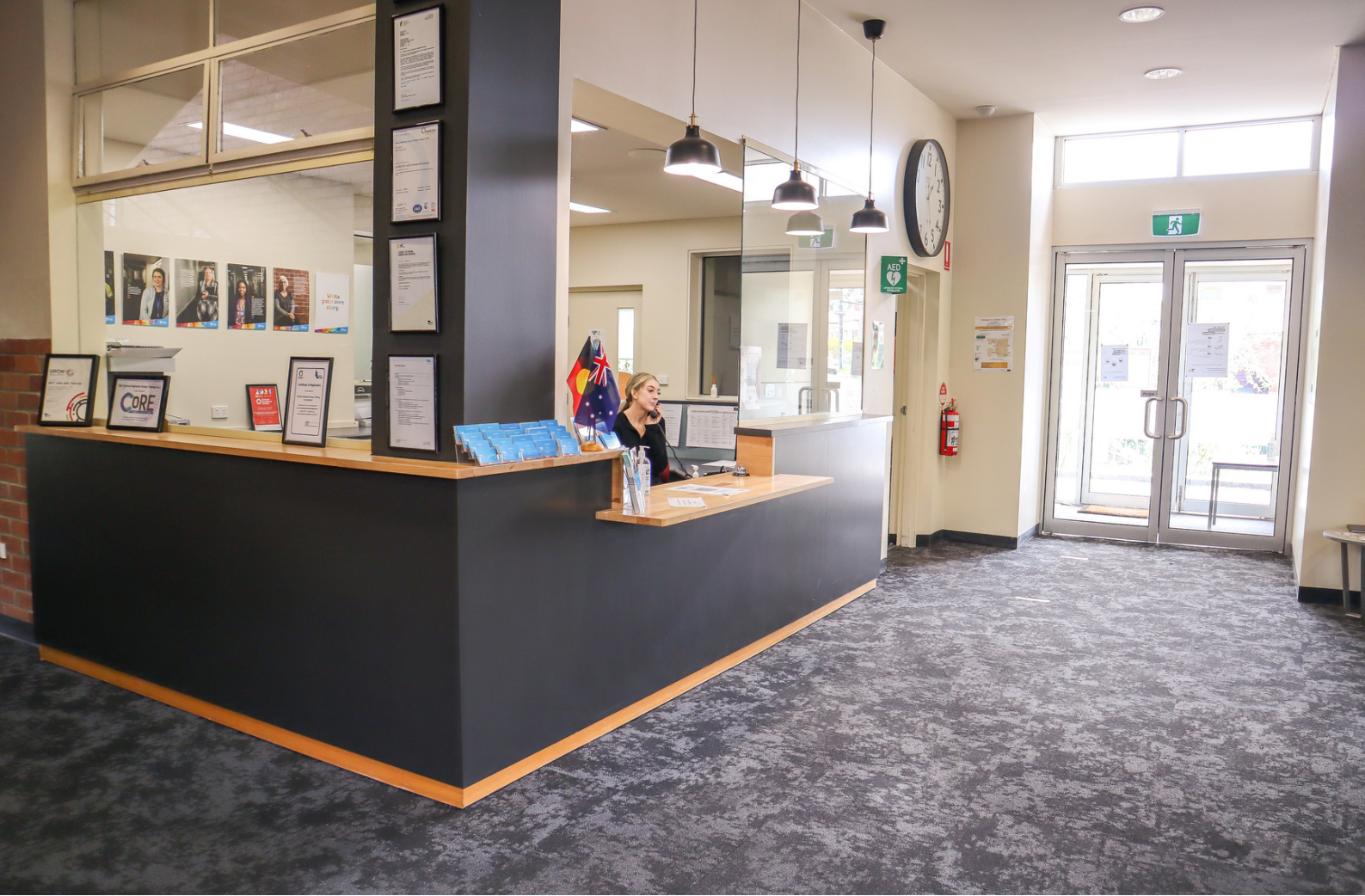
Barkly Square Foyer