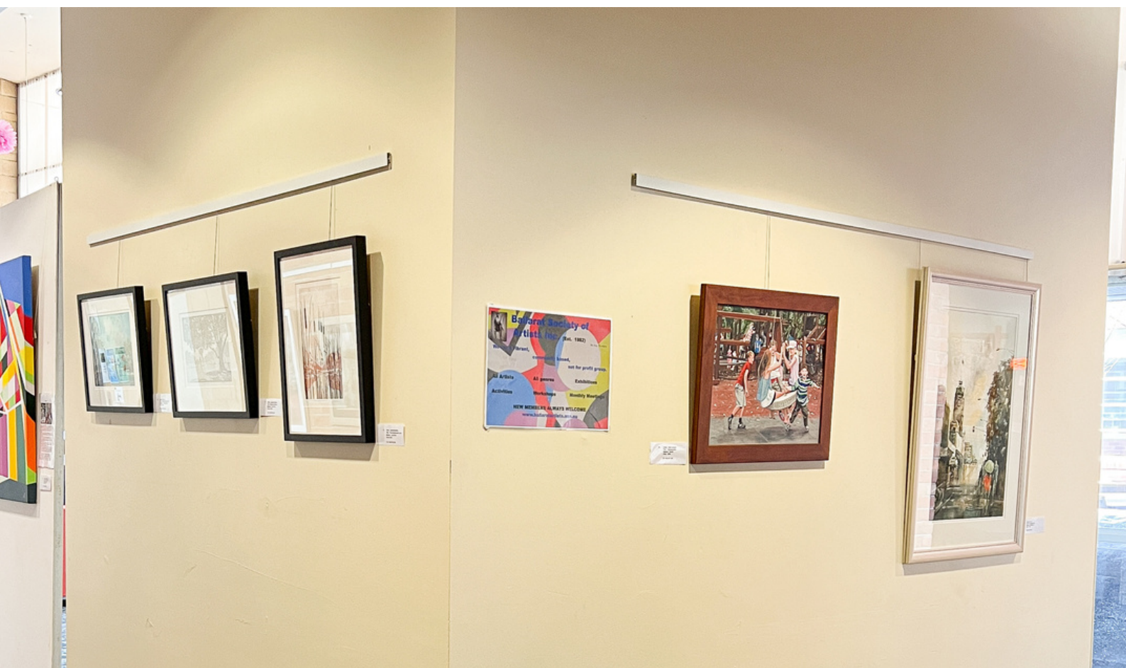
Installation of Artwork for Ballarat Society of Artists Winter Show