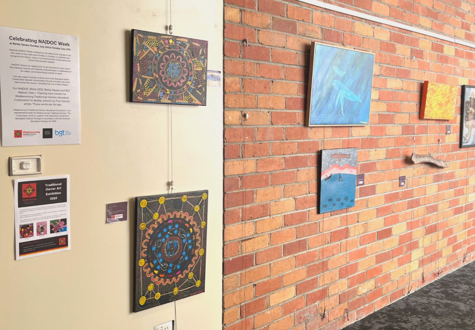
Installation of Artwork for NAIDOC week by The Waddawurrung Corporation