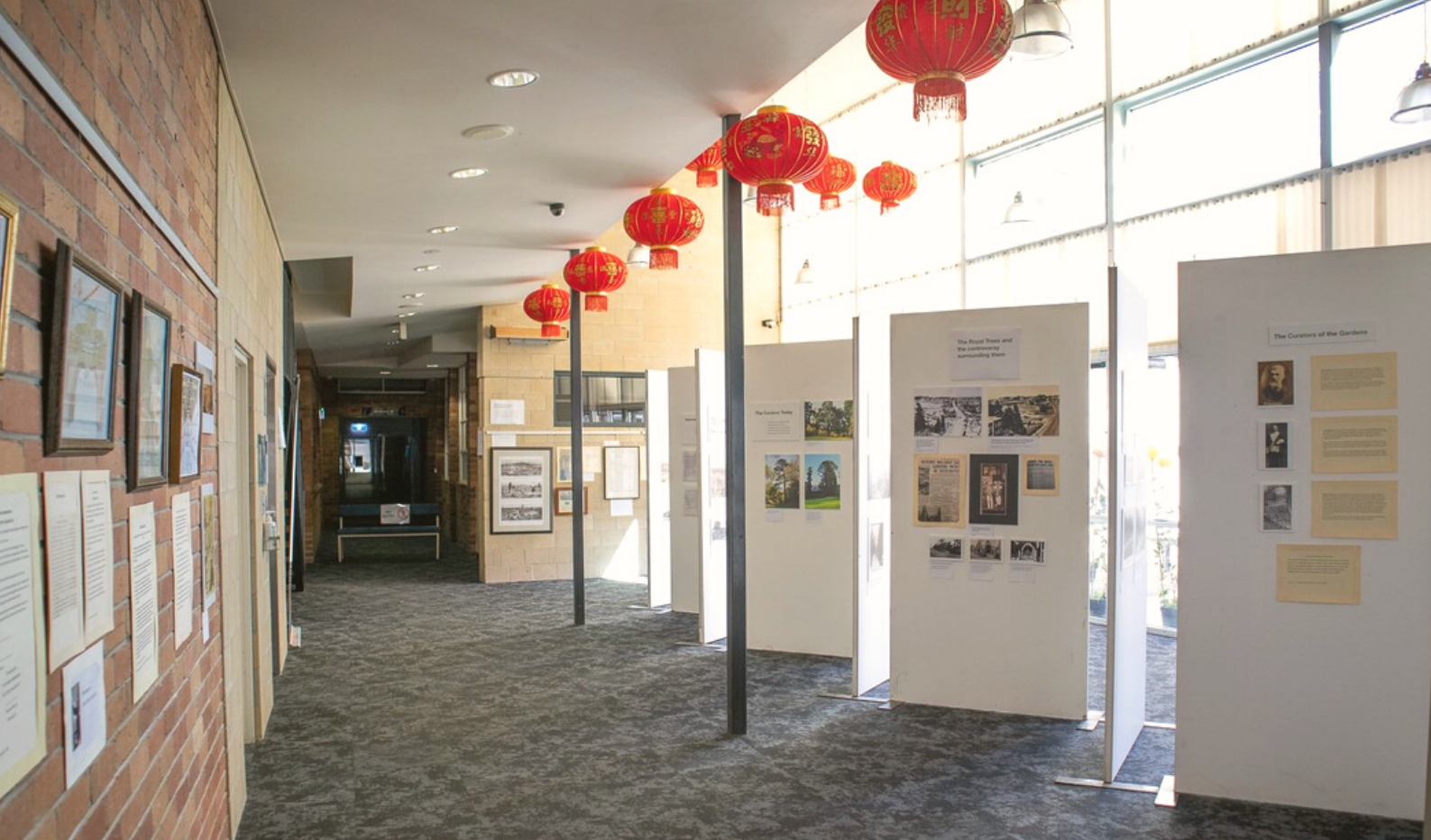
Atrium Community Space with Oasis in the Desert installed, Heritage Weekend